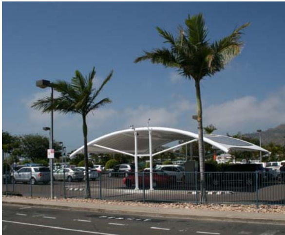
Solar Shade Project